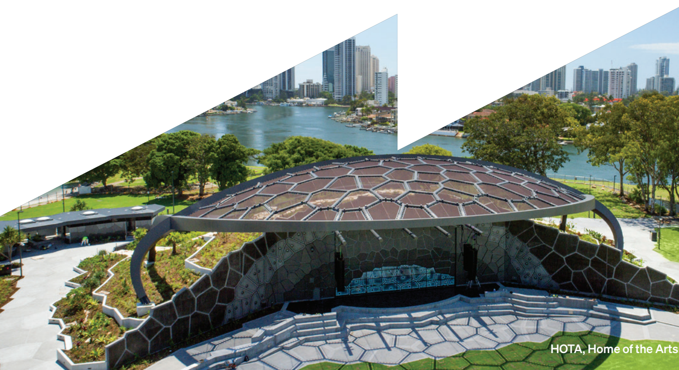
HOTA, Home of the Arts